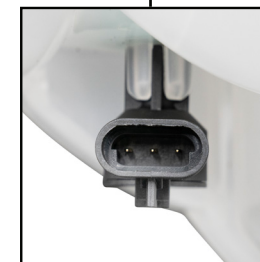
Coolant Level Sensor